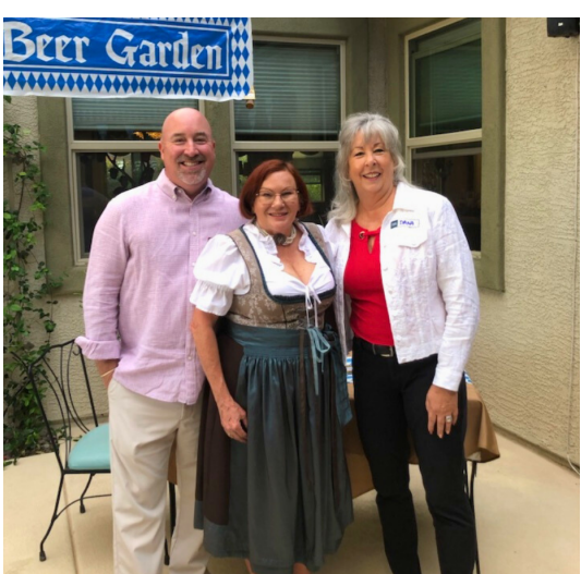
Mark your 2024 calendar for October 6. Plan to come to the next Schmitt's Annual Oktoberfest Party, lift a bottle of Oktoberfest beer, and join in a toast for the wunderbar organization we proudly know as United Way of Southern Nevada!