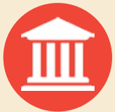
COLLEGE ACCESS ACTIVITIES

Partner agencies Communities in Schools of Nevada, Junior Achievement of Southern Nevada, Leaders in Training and UNLV Back on Track helped students get on track to graduate.